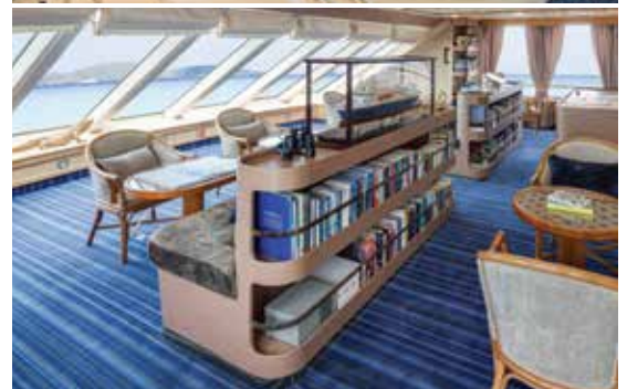
From top: Dining excellence and regional flavors are a hallmark of our expeditions; Observation lounge and library.